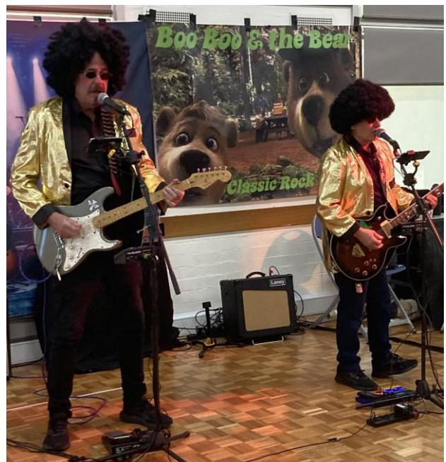
To Book: https://www.entertainoz.com.au/bands-musicians/60-s-90-s/booboo-the-bear/

Special thanks to Banyule City Council for the $300 grant we received to go towards our end of year breakup. This was put towards the food for our volunteers and decorations.